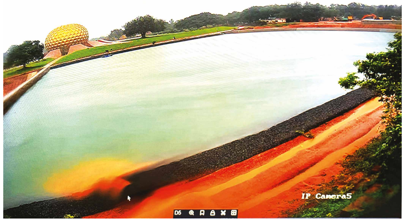
The Matrimandir lake, section 1, completely filled by the rains of cyclone Fengal on 30 November 2024, just before the left end wall slid open.