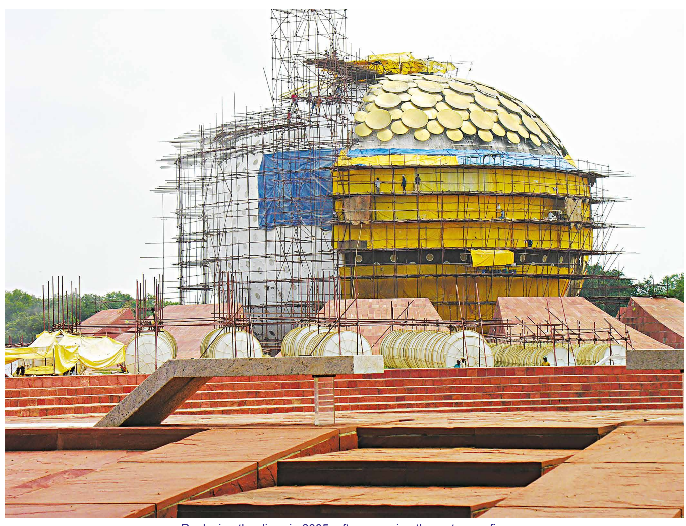
Replacing the discs in 2005, after renewing the waterproofing

powder was fused into the triangles of glass to give the required hue. Many trials were made under the direction of someone experienced in this field. The oven was a giant, fired by 100 gas bottles. Finally, this too was a "no go" as a consistent production of triangles with the correct evenly spread color could not be achieved. So, back to square one!